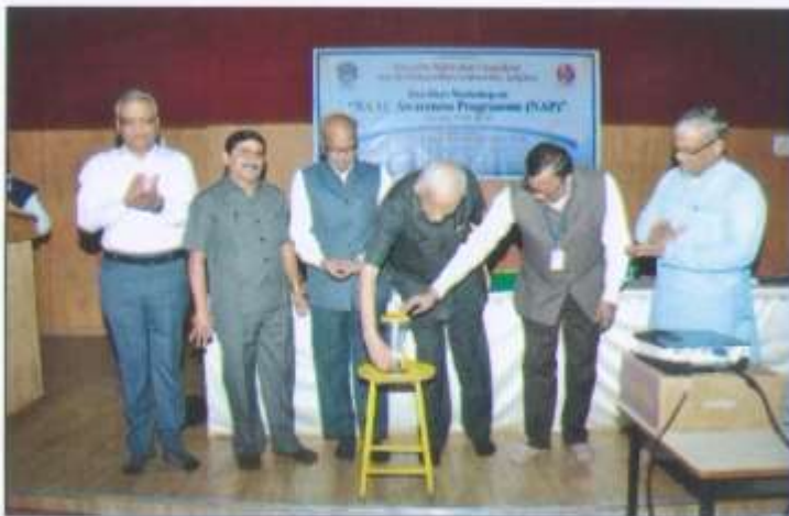
Inauguration of NAAC Awareness Programme (NAAP) held on January 17-18, 2019