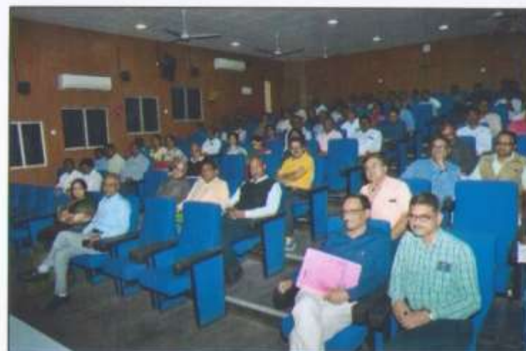
Participants in NAAC Awareness Programme (NAAP) on January 18, 2019