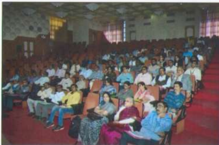
Participants in NAAC Awareness Programme (NAAP) on January 17, 2019